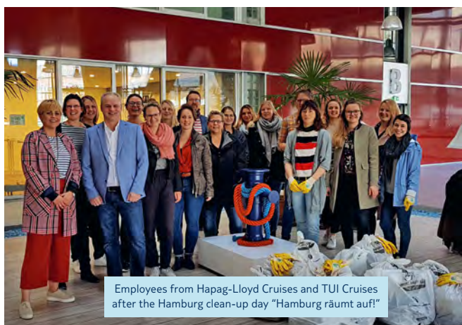
Employees from Hapag-Lloyd Cruises and TUI Cruises after the Hamburg clean-up day "Hamburg räumt auf!"

By supporting a wide range of international and local initiatives, TUI Cruises continued to shoulder social responsibility at corporate sites and the destinations served worldwide in the year under review.