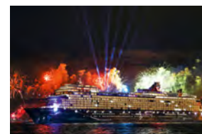
On February 9, 2019, Mein Schiff 2 was christened in Lisbon.

Fleet in 2019: 7 vessels in service, three vessels in the planning